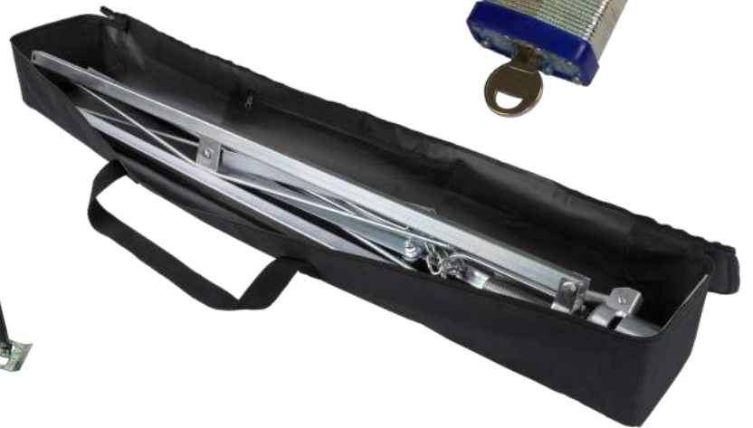
19-950800 STORAGE BAG

Why don't other brands have a lifetime warranty?