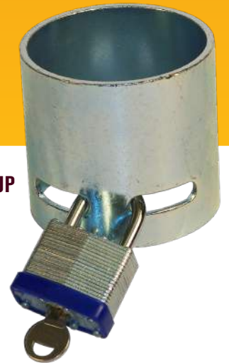
48-979008 FIFTH WHEEL LOCKING CUP