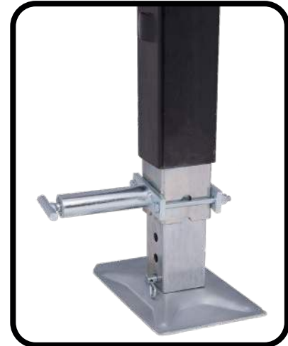
UF# 17-943031 (3/8") UF# 17-943032 (7/16") Quick Pins