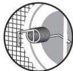
Hook should engage three wires

NOTE: Screen position can be adjusted using other anchor points. Gaps between screen and RV siding may require caulking.