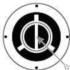
Suburban DD Series

Protects RV appliances from mud daubers, wasps, mice, and birds while maintaining air flow.