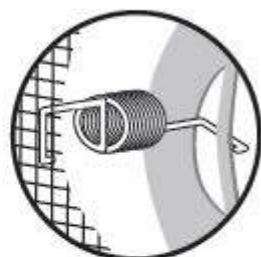
Hook should engage three wires

NOTE: Screen position can be adjusted using other anchor points. Gaps between screen and RV siding may require caulking.