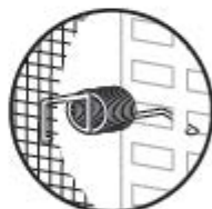
Hook should engage three wires

NOTE: Screen position can be adjusted using other anchor points. Gaps between screen and RV siding may require caulking.