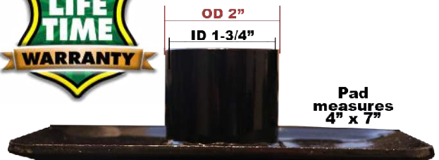
UF# 49-954037 for 2" model