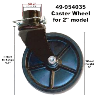
49-954035 Caster Wheel for 2" model