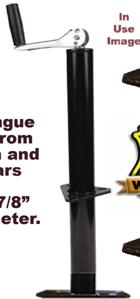
In Use Image