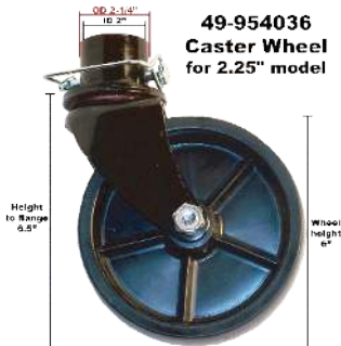
49-954036 Caster Wheel for 2.25" model